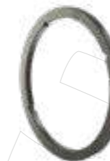
Spacer 2 mm