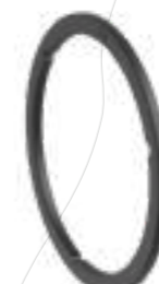
Spacer 1,6 mm