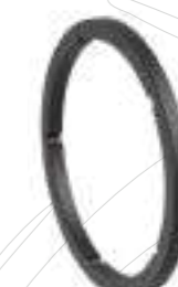
Spacer 2,5 mm