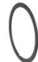
Spacer 0,8 mm